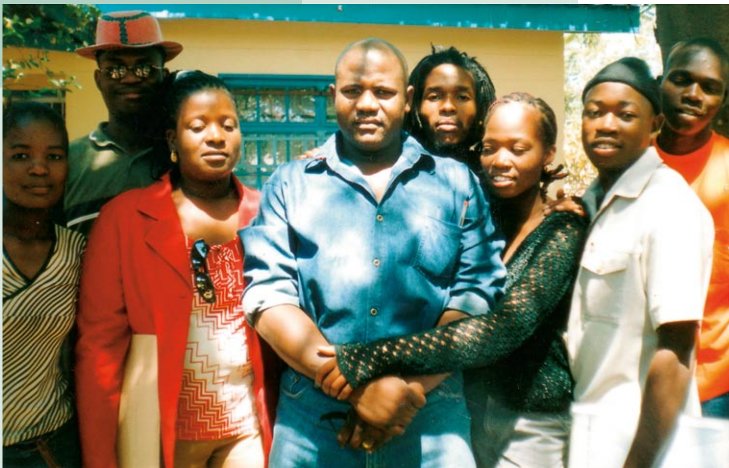
Cluster "A" Peer Educators--Northern Region of Botswana

As the traditional institutions that controlled sexual behaviour in the past have weakened, the responsibility for the sexual socialisation of Tswana youth has shifted to the educational system. Research shows that teachers are a trusted source of information, especially among older teens. 12 However, students tend to turn to their peers for counselling and advice in decisions regarding sexual behaviour. This information is important in understanding why efforts to motivate parents to talk with their children about sex have so not been very effective.