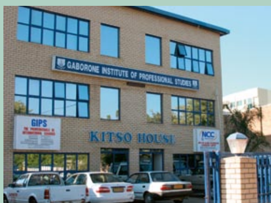
Gaborone Institute of Technical Training

According to the Vocational Training Act of 1998, a training institution means "a private or public centre, organisation, employer or person, providing vocational training". In Botswana vocational training is offered by a number of different training institutions, which need to be registered and accredited for their series according to the Botswana National Vocational Qualifications Framework (BNVQF).