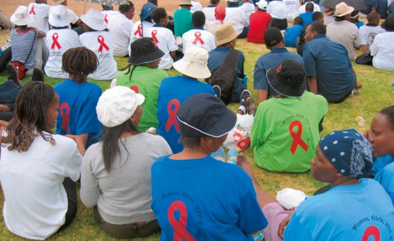
World AIDS Day Parade 2004 in Gaborone

The content and scope of HIV/AIDS unit standards need to be clearly defined