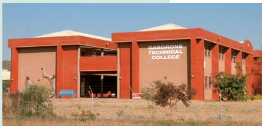
Gaborone Technical College