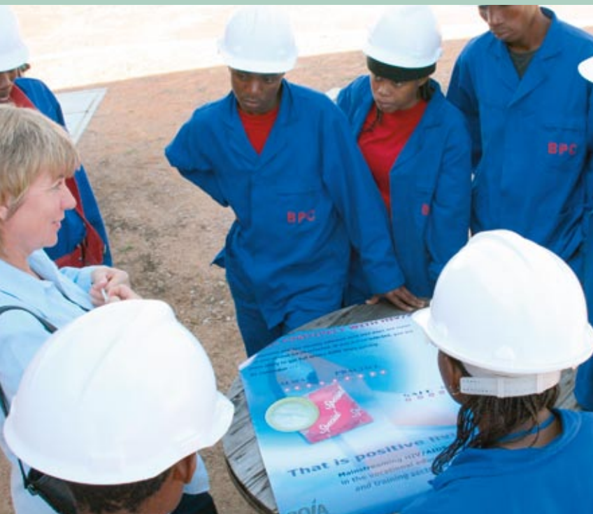
Introduction of BOTA's IEC material at the Botswana Power Cooperation (BPC) Training Center in Gaborone

The Structured Work-Based Learning approach provides a range of learning pathways that are linked to established quality assurance processes. The learning process is underpinned by principles of access and equity, gender and HIV/AIDS considerations, as well as by the promotion of life-long learning.