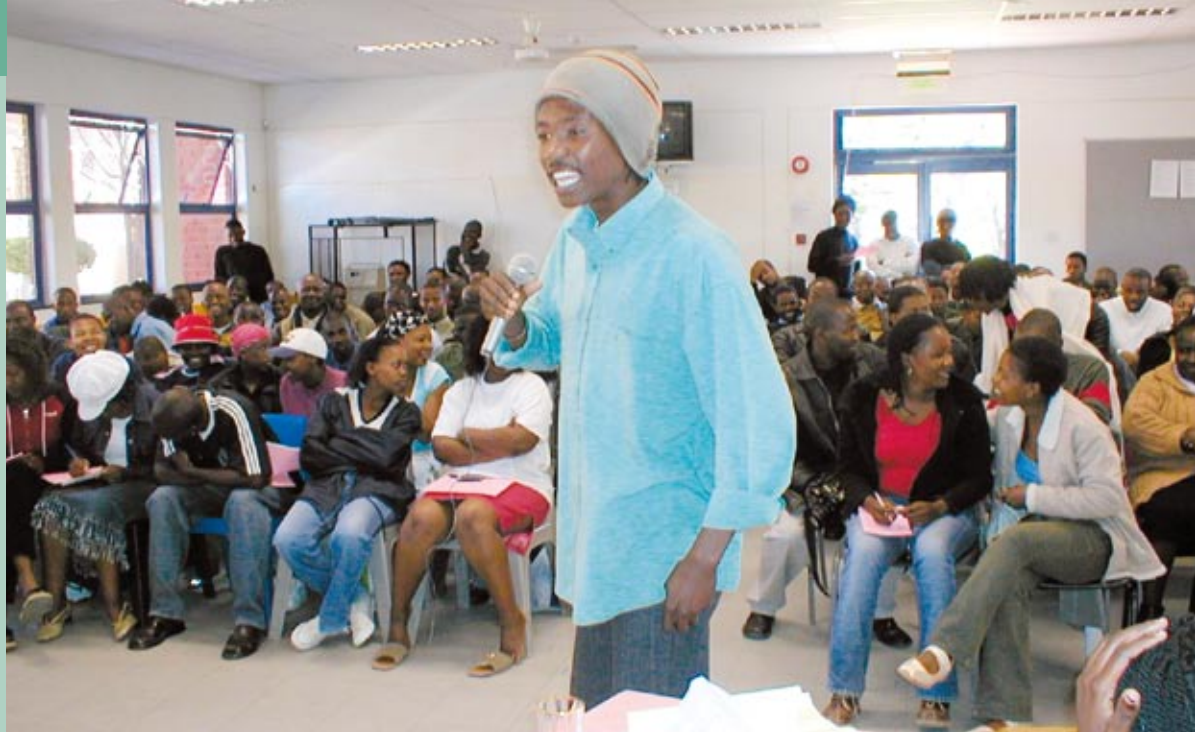
HIV/AIDS Debate 2004 at the Automotive Trades Technical College (ATTC) in Gaborone