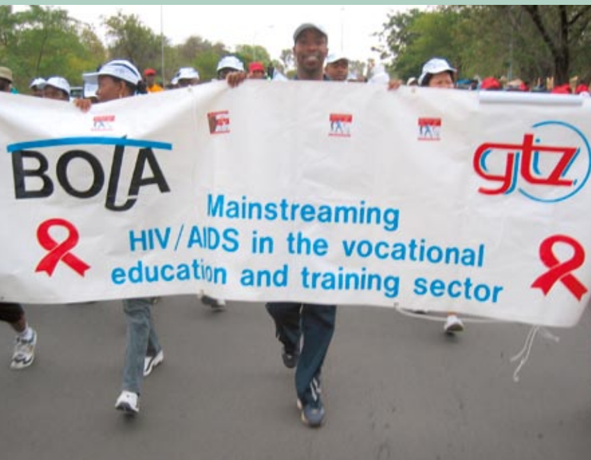
BOTA Delegation at the World AIDS Day 2004 in Gaborone

All these activities are planned and implemented in alignment with the National Strategic Framework for HIV/AIDS (see diagram).