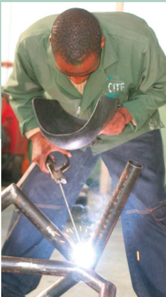
Work-Based learning at the Construction Industry Trust Fund (CITF) in Gaborone

Botswana is one of the few countries in the region that has formalised its response to HIV/AIDS by including HIV/AIDS in the formal qualifications framework of the VT system. It is thus ensured that every learner receives training on HIV/AIDS prevention, treatment and care. Through the SWBL approach, learners and staff are actively involved in BOTA's response to HIV/AIDS, be it through peer education training courses 17 , edutainment, or involvement in HIV/AIDS counselling activities. 18