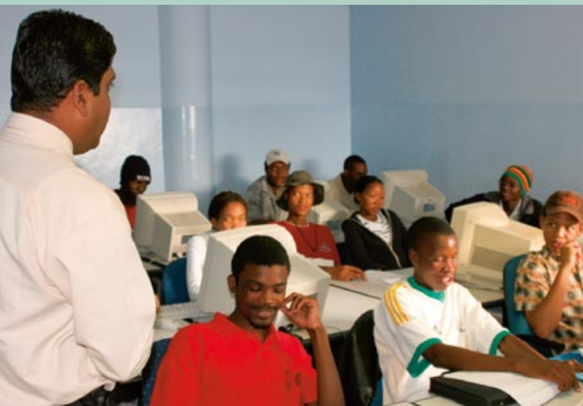
Computer Training at NIIT in Gaborone

However, it is not only learners that are at risk. Although there is little data on mortality and morbidity among trainers, teachers, and staff of the VT Sector, it is estimated that teachers at the primary and secondary level are disproportionately affected, with an annual rising death rate of 60% over the period 1994-1999. 16 In 1997, 26% of all vocational trainers or teachers were expatriates, a percentage that is since expected to have increased due to HIV/AIDS-related attrition amongst Botswana's workforce. Yet even if teachers can be replaced by expatriate staff, the increased morbidity and mortality will gradually erode the sector's "institutional memory". There is not enough time for sick or dying teaching staff to pass on the experience and expertise that has been built up over many years, and the quality of training is adversely affected when remaining staff are forced to take on too many extra classes or when less qualified teachers are employed to fill the gaps.