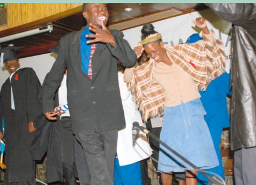
HIV/AIDS Drama Performance by the Kgatleng Brigade Development Trust at the IVETA Botswana 2005 Conference in Kasane

BOTA advises VT institutions on how to develop organisational structures and processes that facilitate the mainstreaming of HIV/AIDS. This includes support in developing an HIV/AIDS policy as well as in establishing HIV/AIDS committees and structures. Committees can take different forms, and are typically either separate committees or sub-committees of broader committee structures (e.g. counselling and guidance committees).