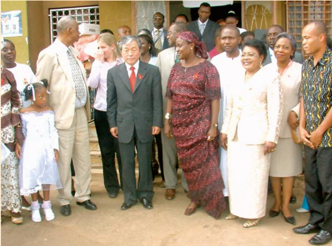
WHO Director General visiting RéCAP+, November 2005

A promising perspective: PLWH organisations can make ARV programmes more equitable and effective Access to ARV treatment and the reduction of its price is an important goal for PLWH. In Cameroon, the decentralisation of ARV-treatment is planned for the year 2006: PLWH support groups play a key role in this process and RéCAP+ needs to consider the challenges accompanying it.