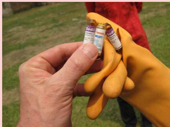
Buprenorphine, diazepam and an antihistamine – the “South-Asian cocktail” popular among Bangladeshi injectors, as it mimics the effects of heroin.

A participatory approach is a key part of tailor-made HIV prevention and harm reduction programmes. Most of the projects have used such an approach. Depending on their context, national, regional and local authorities, as well as civil society organizations, have been involved. Furthermore, the target group itself is always included as a valuable resource in assessment, planning and implementation. For example, the Viet Nam project engaged drug users in needs assessment and the Ukraine project trained drug users to provide services to their peers. By doing this, the projects helped drug users and others to develop new skills and abilities, empowering them. Capacity building, such as training in the development of services for female drug users and integrated local drug policies, has involved a wide range of actors. This in turn has allowed for better skills-building processes and more integrated responses to overlapping issues. Participants are, therefore, gaining new tools and methods to develop their own strategies and projects, which encourages them to take ownership and, help themselves.