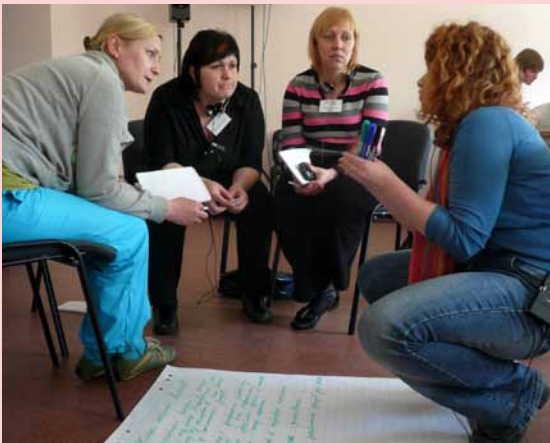
Trainer helps trainees tailor gender-sensitive services for female drug users at session in Kiev, Ukraine, April 2009.

The need for multidisciplinary teams to provide OST, in an integrated manner, is also widely understood, though, the evaluation noted that multidisciplinary protocols had yet to be “fully implemented”.