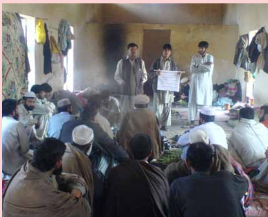
Pakistani inmates listening to a social worker of "DOST Welfare Foundation" during an "awareness-session" in a prison.

According to surveys, the number of chronic users of heroin in Pakistan increased from about 20 000 in 1980 to more than 1.5 million in the late 1990s; but health services reach less than 10% of most-at-risk IDUs, and other most-at-risk populations. As part of efforts to encourage health reform, GTZ has provided technical assistance and funding for two innovative projects run by a Peshawar-based NGO, DOST, in the North-West Frontier Province and the Federally Administered Tribal Areas.