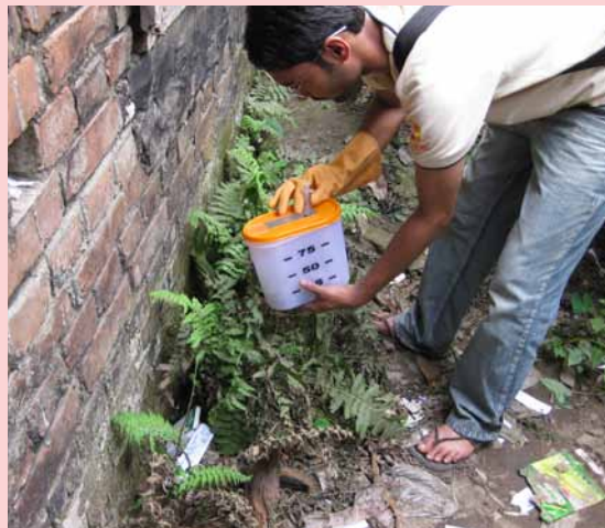
Outreach workers collecting dirty needles in Chittagong.

Among the team's early successes, the process has improved outreach and led to the introduction of drug detoxification for women IDUs. Equally important, it has created effective organizational structures, strengthened community networks and laid the basis for sustainable services to reduce drug-related harm and HIV-transmission.