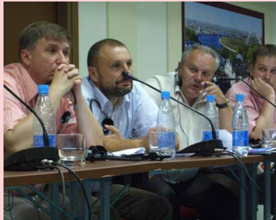
Head doctors from AIDS centres in Vinnytsia, Khmelnytsky, Ternopil and Chernivtsi discuss with stakeholders the results of an interim evaluation of GTZ-backed “ Health Sectors Reform and AIDS Prevention in Ukraine ”, in Kiev, July 2009.

Training in harm reduction for female drug users, meanwhile, had been given to 50 staff members of NGOs by mid 2009, with good early results. The Chernivtsi NGO, for example, immediately doubled the number of female IDUs with access to its services, and by August 2009 was reaching no fewer than 629 female users.