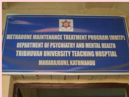
Entrance to Nepal's first methadone clinic, one that could serve as a model for the region.

In terms of capacity building, doctors, nurses and social workers (mainly ex-drug users) at the two clinics have undergone training in OST and harm reduction. Some 40 peer educators have also been trained in the effects and side effects of methadone, concomitant diseases, harm reduction and advocacy. Among their new tools is a booklet in Nepali on methadone treatment, produced under the project by the Tribhuvan Teaching Hospital and the NGO Recovering Nepal.