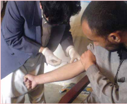
After counselling, more than 1,800 Pakistani prisoners agreed to give blood samples to test for HIV, hepatitis B and C and syphilis – 5% were positive for at least one of the diseases.