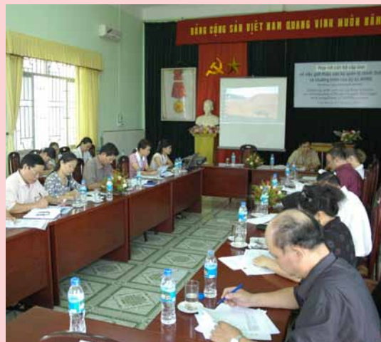
Meeting with provincial key leaders on introducing the official project manager, Cao Bang, August 2007.

Asian Harm Reduction Network trainers also prepared 15 master trainers for each of the two provinces, allowing for subsequent training sessions in districts and communes. This is expected to foster “local ownership” of harm reduction measures. About 20 to 30 officials, professionals and NGO officers have so far had training in each district of the two provinces, pushing the total number trained over 600.