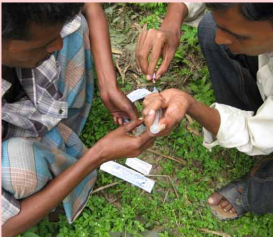
Bangladeshi drug-users preparing to inject.

Bangladesh's Multidisciplinary HIV/AIDS Program, which started in 2004 with GTZ support, aims to improve the prevention, diagnosis and treatment of sexually transmitted infections, including HIV in four major cities: Chittagong, Rajshahi, Sylhet and Khulna. GTZ provides technical support to the city health departments, and works with the National AIDS and STD Program (NASP) to improve the program's linkages with municipal authorities. Efforts to prevent HIV, however, have been hampered by a lack of capacity at national and local levels, poor coordination of programmes, and severe stigmatization that drives high-risk IDUs, sex workers and men who have sex with men underground, where they are often "hidden" from municipal authorities and service providers.