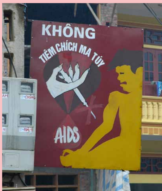
Billboard in Northern Viet Nam warns of the link between injecting drugs and HIV.

agree on the need for broad-based, sustained measures to combat gender, social and economic discrimination in efforts to address HIV and drug use (Federal Ministry for Economic Cooperation and Development, 2008). (See also training manual for gender-sensitive training for providers of services, http://hiv-prg.org/en/toolboxes/ ).