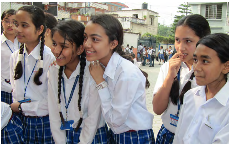
■ The JIC in Nepal, known as SangSangai, addresses a wide range of topics related to sexual and reproductive health and rights. Here, a group of school girls take part in a SangSangai event.

On the basis of their long-standing experience with sexual and reproductive health and rights interventions for adolescents and their country-wide networks, the Nepal Red Cross