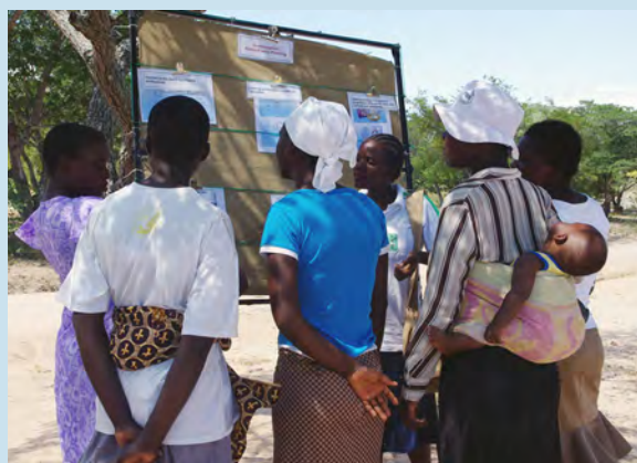
■ Young women from an Apostolic group near Mutare participate in the Join-In Circuit with their infant children. Members of the Apostolic movement are often difficult to reach with health information and services.

Young women, particularly those who are married, are one of the groups most vulnerable to infection with HIV and most in need of sexual and reproductive health services. They are also least likely to be in school (Guttmacher Institute, 2014), which makes them more challenging to reach with interventions.