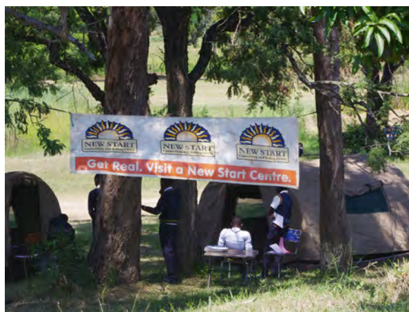
■ Nurses from Population Services International set up their mobile HIV testing and counselling tents in a shady spot on the campus of the Mutare Teachers College prior to the start of the Join-In Circuit. Fifty-three of 76 participants tested for HIV following the run.

Chosen on the basis of their previous performance and other quality criteria, most of these implementing organisations were members of ZAN and were already familiar with the JIC. As HPZ project partners, however, they now received direct capacity building and supervisory support to ensure that the JIC was being implemented in a consistent, high-quality manner. HPZ and the implementing organisations met frequently, both one-to-one (e.g. during quarterly support visits) and as a group (e.g. during annual review meetings).