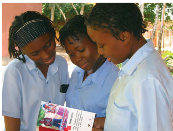
■ Young women and adolescent girls, such as these in Mozambique, have emerged as one of the main target groups for HIV prevention, treatment and care strategies in recent years.

The JIC was designed at a time when the need for a rapid response to the mounting HIV epidemic led to a proliferation of HIV-specific vertical initiatives. For at least a decade now, however, concerted efforts have been made to better integrate responses to HIV and efforts to promote sexual and reproductive health and rights at the level of both policies and programmes. Strengthening the natural linkages between HIV and sexual and reproductive health and rights programmes and services is a GDC policy objective (BMZ, 2012; GTZ, 2008) and seen as key to generating better sexual and reproductive health outcomes overall.