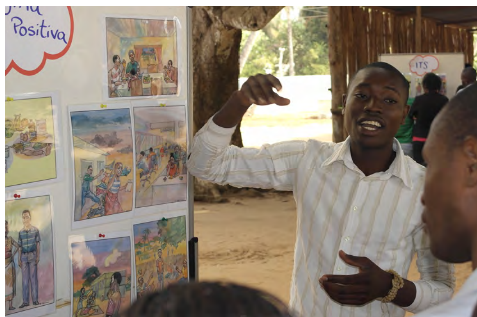
■ Energetic, confident and well-trained facilitators, such as this one in Mozambique, are key to the JIC's success.

Over the past decade GDC has amassed a rich body of experience with different models for institutionalising the JIC in partner countries. The overarching lesson is that the process of handing over the JIC to a national partner or partners is a complex and lengthy one: GDC-supported programmes should think about an 'exit strategy' early on and work steadily towards its realisation, prepared for setbacks along the way.