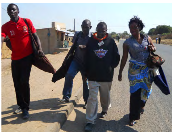
■ Members of a facilitation team on route to a JIC run in Mongu, Zambia. Zambia was the first country where the JIC's original bulky hardware was transformed into a lightweight, mobile tool.

In perhaps no other country has the JIC been used in as many different settings, and with such varied audiences, as in Zambia. Since 2005, when a Zambian version of the JIC first came into use as part of a German-supported youth project, more than 70,000 Zambians of all ages and walks of life have participated in the JIC in workplaces, schools, prisons, town marketplaces, and other community spaces. Among the groups reached by JIC organisers are teachers, pupils, parents, company managers, municipal workers, farmers and farm workers, water technicians, students, factory workers, sex workers, taxi drivers, and truck drivers. The experience from Zambia has shown that when facilitators are well-trained and have credibility with their target audience, the JIC can go practically anywhere and be used with practically any group.