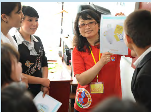
■ A facilitator speaks with tenth-graders at a secondary school in Bishkek, Kyrgyzstan about condoms and the dual protection they offer against sexually transmitted infections and pregnancy.

In Russian, the JIC is known as 'Marshrut Bezopasnosti' (roughly translated: 'Route of Safety'), a name which gestures at the notion of navigating a voyage through adolescence and its incumbent risks.