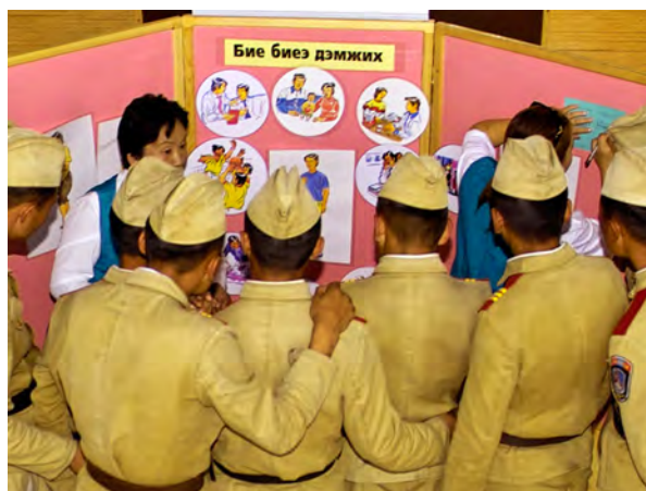
■ In Mongolia the Join-In Circuit has been used to reach military recruits with information about HIV, sexually transmitted infections and safe sexual behaviour.

Source: GIZ (2011). Boosting Prevention: The Join-In Circuit on AIDS, Love and Sexuality