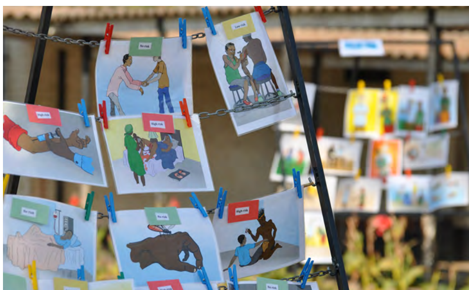
■ Images from the HIV transmission station in the Zimbabwean version of the Join-In Circuit. When the Mozambican Join-In Circuit was adapted for use in Zimbabwe, new images were created and tested with local audiences to ensure that they were socially and culturally acceptable.

A project progress review conducted in 2010 noted these limitations and urged HPZ to bring a sharper strategic focus to JIC implementation, including by working towards greater coverage of the JIC in a smaller geographical area and strengthening the approach to monitoring and evaluation (M&E) to better understand the JIC's outcomes. The following section describes how these recommendations were taken up.