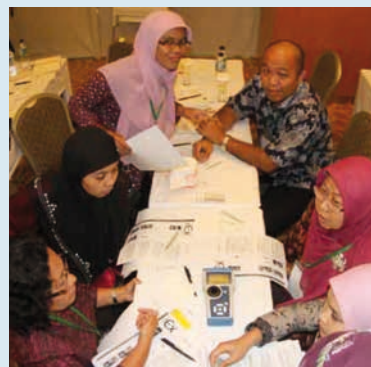
>> Participants in the North Sumatra workshop receive training in a quantitative mobile testing device.