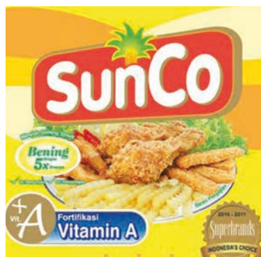
>> Recipient of Indonesia's 2010 'Superbrand' award: cooking oil fortified with vitamin A.

In 2009, the Indonesian National Planning Board set up a steering committee and an implementation committee for fortification of cooking oil with vitamin A. Committee membership included representatives from various government units that worked with KFI. In the same year, a five-year strategy was announced, with the goal of reaching more than 200 million Indonesians with fortified cooking oil. Ultimately, it is intended that vitamin A fortification will be mandatory, based on a national standard issued by the National Standardization Agency and monitored by the Indonesian Food and Drug Board (BPOM).