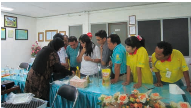
>> SAFO-supported training workshop at a major oil mill in 2011