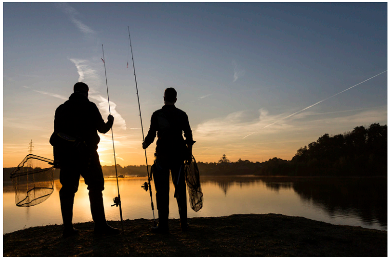
For too long, the considerable importance and impacts of recreational fisheries have been ignored.

Although commercial capture fisheries globally harvest about 8 times the fish biomass caught by recreational fisheries (4), in many localities recreational landings now rival or even exceed the biomass removals by commercial fisheries. In inland waters in the temperate zone, recreational anglers are now the predominant users of wild fish stocks (5), and recreational fishers have become prevalent in many coastal and marine fisheries (6, 7). Globally, recreational fishers catch about 47 billion individual fish per year, of which more than half are released alive (4), either because of harvest regulations or in response to personal ethics (8). Despite high release rates, fishing for food is a