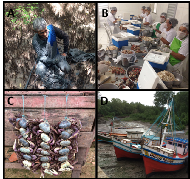
Fig. 2. (A) A fisher harvesting mangrove crabs ( Ucides cordatus ) by hand. (B) Women processing cooked crabs in a privately owned facility. (C) Live mangrove crabs for sale in Bragança city market. (D) Fishing boats during low tide in the mangrove estuary.

rainy season, from January to May, is more difficult and dangerous for fishing activities than the dry season from June to December.