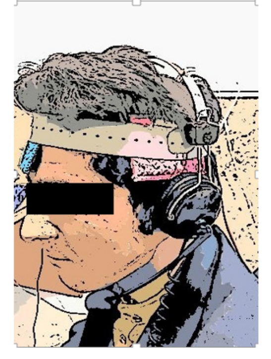
Figure 2. Electrode placement.