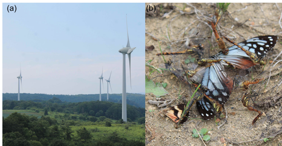
FIGURE 2 Wind park on a mountain top in Japan (a). Dead insects (b) collected during a 15-min search under a single turbine at site (a) included two butterflies (Lepidoptera) and dragonflies (Odonata) (note that insects were piled up for the picture and that some insects show physical injuries)

annually by a single wind turbine in Germany. It is important to note here that these estimates are sensitive to deviations from model assumptions, and thus they certainly require further confirmation based on robust empirical data. For example, these estimates may vary largely across regions, depend on the composition of local insect assemblages and on the relevance of insect migration in a specific region. Nonetheless, the postulated numbers hint at the magnitude at which insect fatalities might occur at wind turbines in the temperate zone. It is likely that this situation is aggravated in regions with a higher abundance of aerial invertebrates compared with Germany.