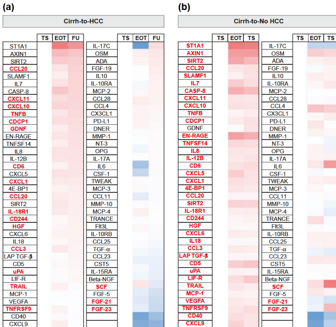
FIGURE 3 Effect of interferon (IFN)-free direct-acting antiviral (DAA) therapy on plasma soluble immune mediator (SIM) levels. Fold changes in plasma SIM concentrations of the cirrhosis patient cohorts that upon DAA therapy either developed HCC (Cirrh-to-HCC) or remained without any HCC (Cirrh-to-NoHCC) were calculated at end-of-therapy (EOT) and follow-up (FU) time-points in reference to baseline values. (a) Plasma SIM kinetics of Cirrh-to-HCC patients from therapy start (TS) through EOT to FU. (b) Plasma SIM kinetics of Cirrh-to-NoHCC patients from TS through EOT to FU. A one-way analysis of variance with the recommended Geisser–Greenhouse correction was used for statistical evaluations. Significant variables are indicated in red

concentrations of a myriad of SIMs. To the best of our knowledge, these findings show for the first time that elevated pretherapy SIM concentrations (such as those of GDNF, FGF-5 and IL-15RA) could serve as independent predictive biomarkers for HCC emergence, and distinguish Cirrh-to-HCC from Cirrh-to- NoHCC patients regardless of de novo or recurrence classification. A prior example suggestive of an association between pretherapy serum SIM levels and the emergence of de novo HCC upon DAA treatment in patients with HCV infection has recently been shown. 15 Our data here drawn from Olink’s innovative multiplex technology fairly confirms this observation, although with a different set of SIMs aside eotaxin (CCL11). This study thus extends the spectrum of SIMs whose baseline concentrations and possible networks could be linked with HCC