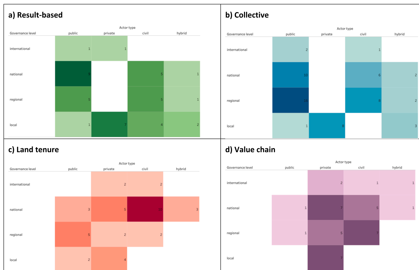
Fig. 2. Comparison of involved actors per societal sphere and governance levels across contract types.

For the single roles the following observations can be made: